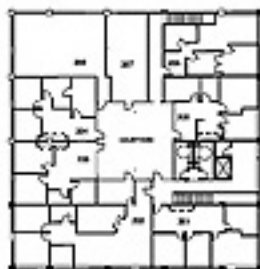
BUILDING - A 2 STORY (2ND FLOOR)